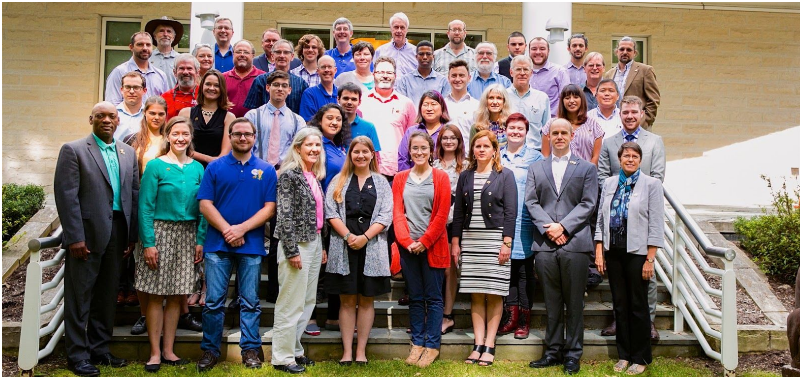
2017-18 National Council